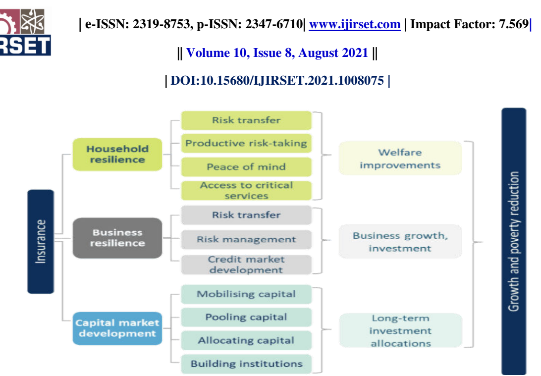
Figure 1: Insurance for growth transmission mechanisms

About digitizing intermediary experience Web-based platforms and mobile apps are expected to be key sales channels. Personalized products, lower premiums, and prompt services are some essential facets. Players have been quick to adapt and have introduced specific covers for pandemics, policies tailor-made to customer expectations and requirements, digital access to services, and enhanced claim settlement mechanisms. Increases in overall mortality risk should lead to increases in premiums or decreases in offerings ( a form of universal rejection ). Given that the primary function of the life insurance market is to correctly forecast mortality risk, the response could be sharp and swift, due to both direct effects from Covid-19 and indirect effects from other changes in behavior.[3]